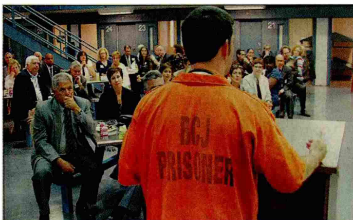
A Bergen County Jail inmate addressing community leaders.